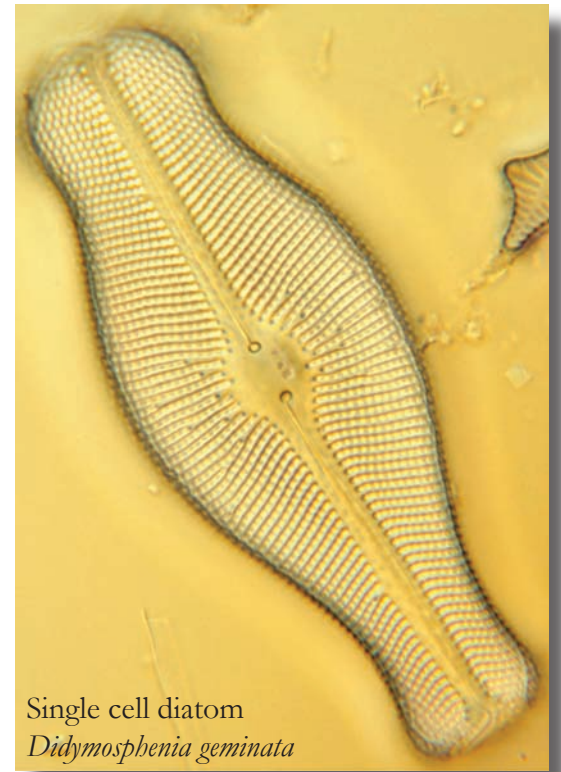
Single cell diatom Didymosphenia geminata

Didymo can smother streambeds and adversely affect freshwater fish, plants and invertebrate populations by depriving them of habitat. It can also impact recreational opportunities but is not considered a human health risk at this time. Didymo develops stalks to attach itself to the streambed. These stalks can form a thick brown mat, effectively covering the entire river channel. Didymo can entangle itself in streamside vegetation resembling wet tissue paper.