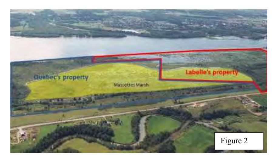
FY13 VDGIF Progress Report Quebec Conservation Initiative_Final

The wetland complex of Massettes Marsh is located on the north shore of the Ottawa River. DUC's GIS modeling ranks the Massettes property as an important wetland for waterfowl in Ouebec. The complex of Massettes Marsh is a mix of quality natural habitat and managed wetlands that sits between public land (Province of Quebec) and private land (the Labelle property; Figure 2). The site was enhanced in 1978 but since, the water-control structure and dyke have seriously degraded and need restoration. After several attempts to renew an expired conservation agreement, the option of purchasing the Labelle property has become viable. The acquisition of these 145 ha (358 acres) have furthered consolidation of riparian wildlife ecosystems along approximately 40 km of shoreline between Gatineau and Thurso. This also gives DUC access to rebuild the 84 ha (207 acres) wetland project where the infrastructure has reached the end of its functional life. Massettes Marsh was the largest remaining tract of land required to consolidate the Ottawa River habitat mosaic of more than 3,000 ha (7,413 acres). This purchase is part of our securement agreement with Quebec Ministry of Natural Resources (QMNR) and title will be transferred to QMNR to minimize carrying costs and DUC will maintain a conservation easement on the property. DUC invested $466,000 for this project.