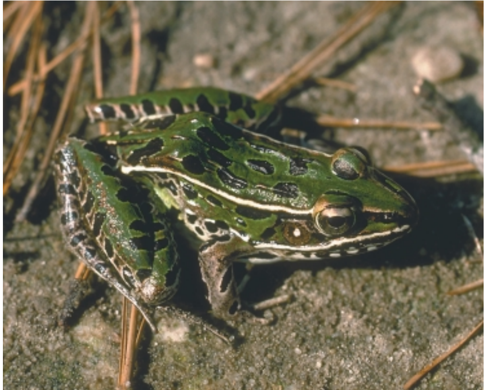
A healthy adult leopard frog.

You may not think that you can make a difference, but caring for your lawn in an environmentally sensible way can have a bigger impact than you might think. Your lawn is only a small piece of land, but all the lawns across the country cover a lot of ground. That means your lawn care activities, along with everyone else's, can make a difference to the environment. If you use pesticides and other chemicals to maintain your lawn and garden, you can help reduce the amount of pollution reaching our nation's waters and harming frogs, as well as other fish and wildlife, by changing the way you care for your yard.