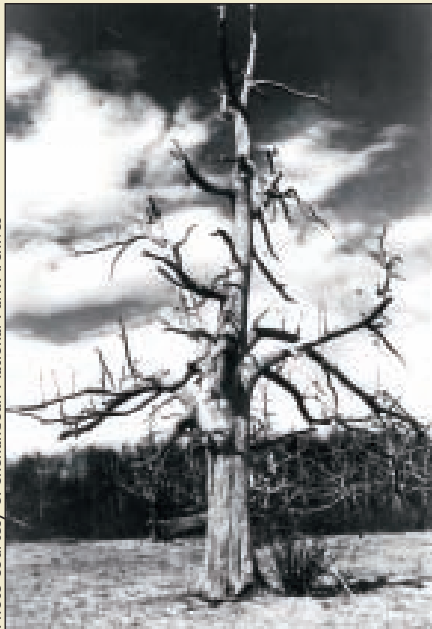
A lone chestnut snag stands in Big Meadows in Shenandoah National Park, Virginia. Right: Illustration by Susan Bull Riley. (Courtesy of The American Chestnut Foundation.)

Photo courtesy of Shenandoah National Park Archives