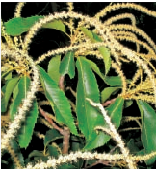
American chestnut in full blossom.