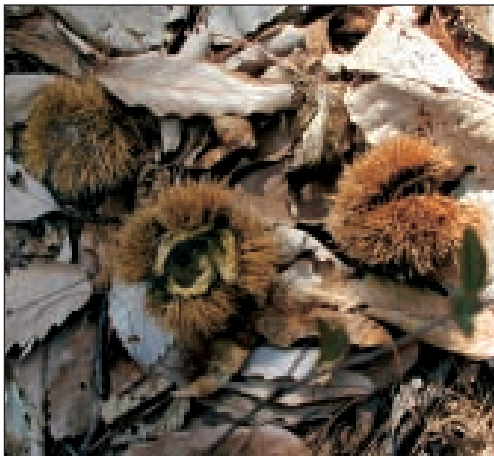
Left: American chestnut bur in winter, photo by Kathy Marmet.

er, the fungus does not kill by attacking a tree's root system. Instead, it attacks the bark, killing all living tissue above the infection. As a result, though felled by the blight or nipped off by a passing deer, chestnut seedlings continue to exist in our forests, persistently sprouting again and again for many years.