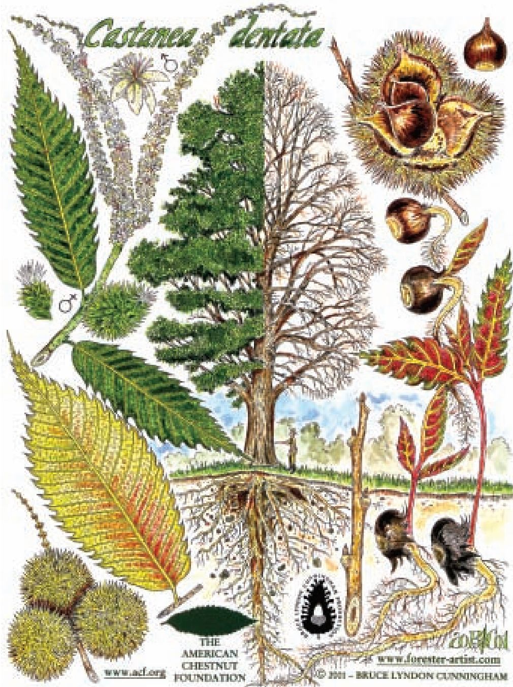
Above: The anatomy of an American chestnut tree. Illustration by Bruce Lyndon Cunningham, 2001. (Courtesy of The American Chestnut Foundation.)

Nevertheless, restoring the kingpin of our forests has proved a hard nut to crack. The microscopic fungus blown on a breeze has proved a worthy opponent to the toughest and greatest of our trees and the best and brightest of its supporters for nearly a century. Today, the blight is firmly established in the southern Appalachians, and any American chestnut sprout opportunistically pushing its stem through the soil in the spring is guaranteed to fall victim to it within 10 years or less. Fortunately, howev-