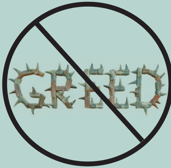
The word GREED is spelled out using turkey spurs removed and kept by a poacher from his illegally killed turkeys.

You can help support this effort by sending a tax-deductible donation to: Virginia Crime Line, P.O. Box 11104, Richmond, VA 23230-1104 or by calling (804) 367-1242.